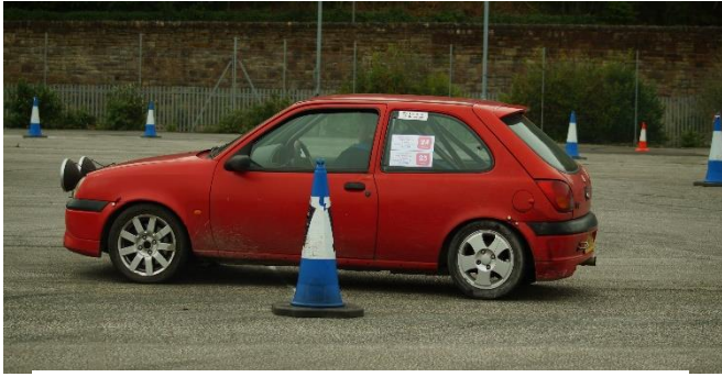
WILL & DEIO HUGHES 1 st & 2 nd IN A FORD

There were 8 entries in the event, lower than what we expected but a good days competition for them. This event ran all the same tests as the Autotest event with the only difference being they could drop their 2 worst runs.